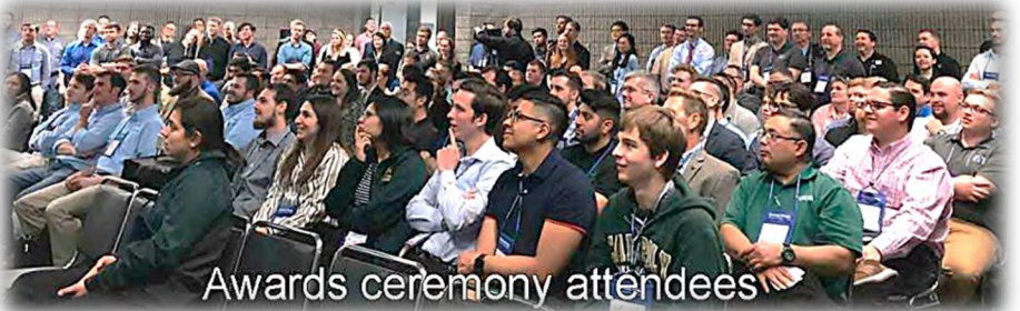
Awards ceremony attendees